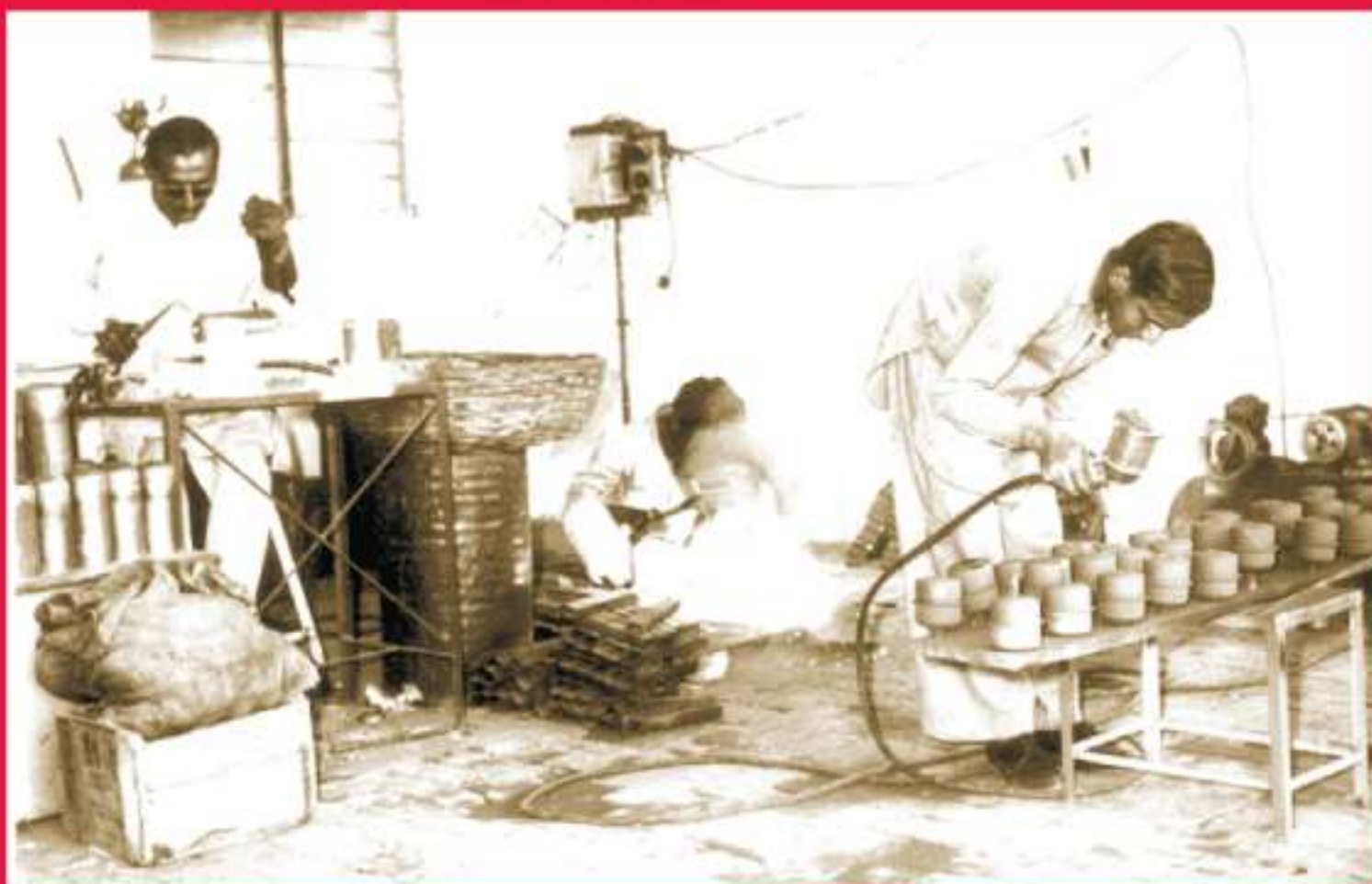
Paint process..... Then

The success of this venture soon led to the establishment of a small scale filter manufacturing unit in Faridabad, just across the Delhi border, which saw the rise of the brand, which is now synonymous with quality filters and customer satisfaction. This facility, with a handful of workers and a few machines, manufacturing nearly 100 filter per day, has now expanded to three filter manufacturing units, with an annual capacity in excess of 42 million filters.