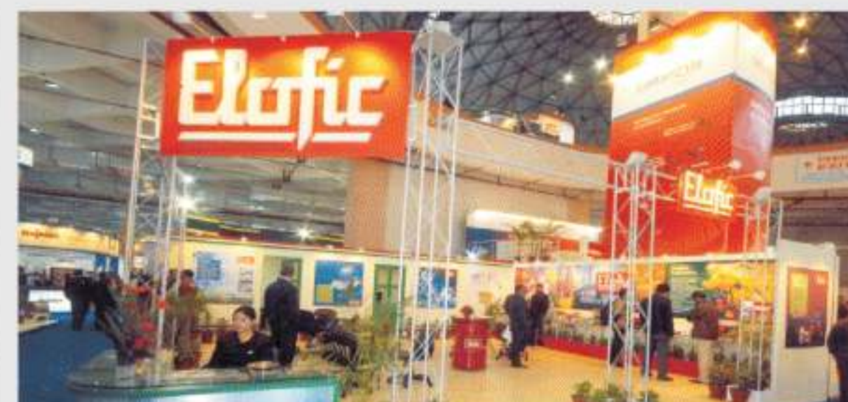
Auto - Expo 2010