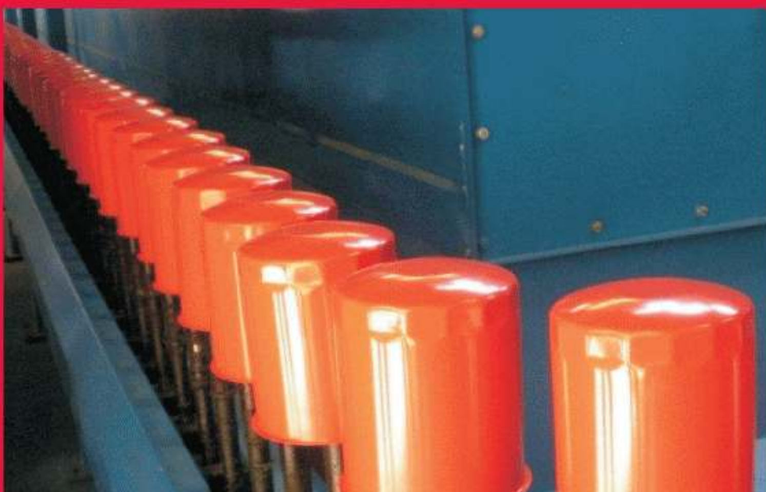
Paint process..... Now