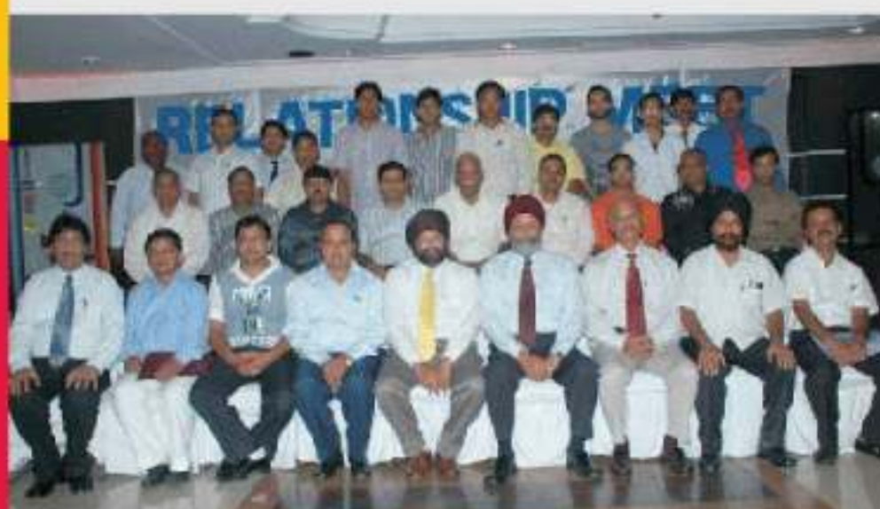
Relationship meet at Faridabad, with Distributors from Delhi & Haryana.

As always, Elofic participated in the 10th Auto - Expo show that was held at Pragati Maidan, New Delhi from 4th - 11th Jan, 2010. On display at our 100 sq mtr stall were the complete range of filtration and lubrication Products. The display at the stall was a grand success and it attracted a very large no. of visitors.