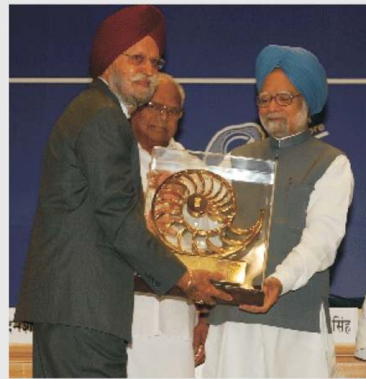
The Chairman receiving the award from the Hon'ble Prime Minister Sh. Manmohan Singh.